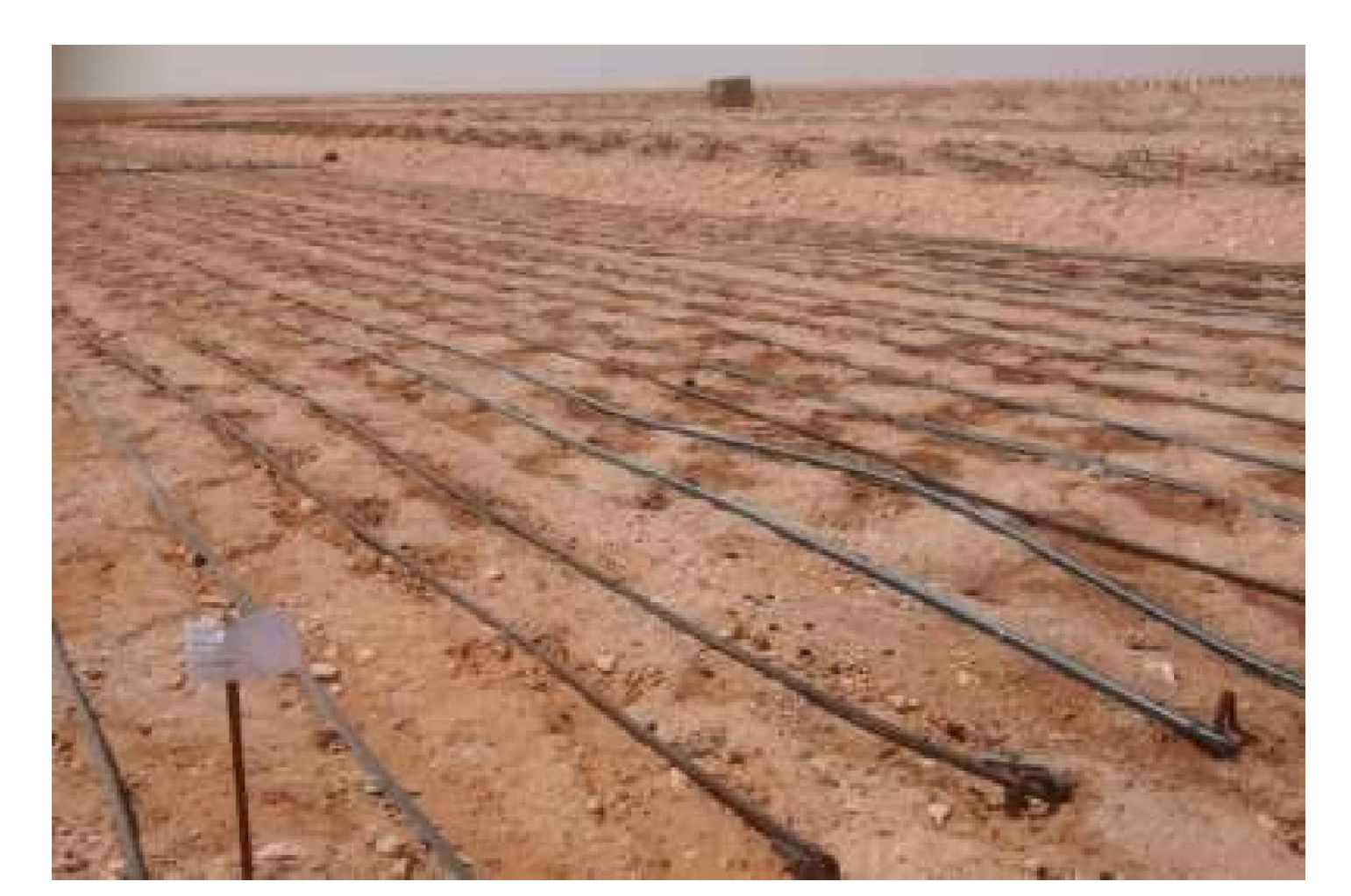
DETAIL B - TYPICAL DRIPLINE IRRIGATION ARRANGEMENT