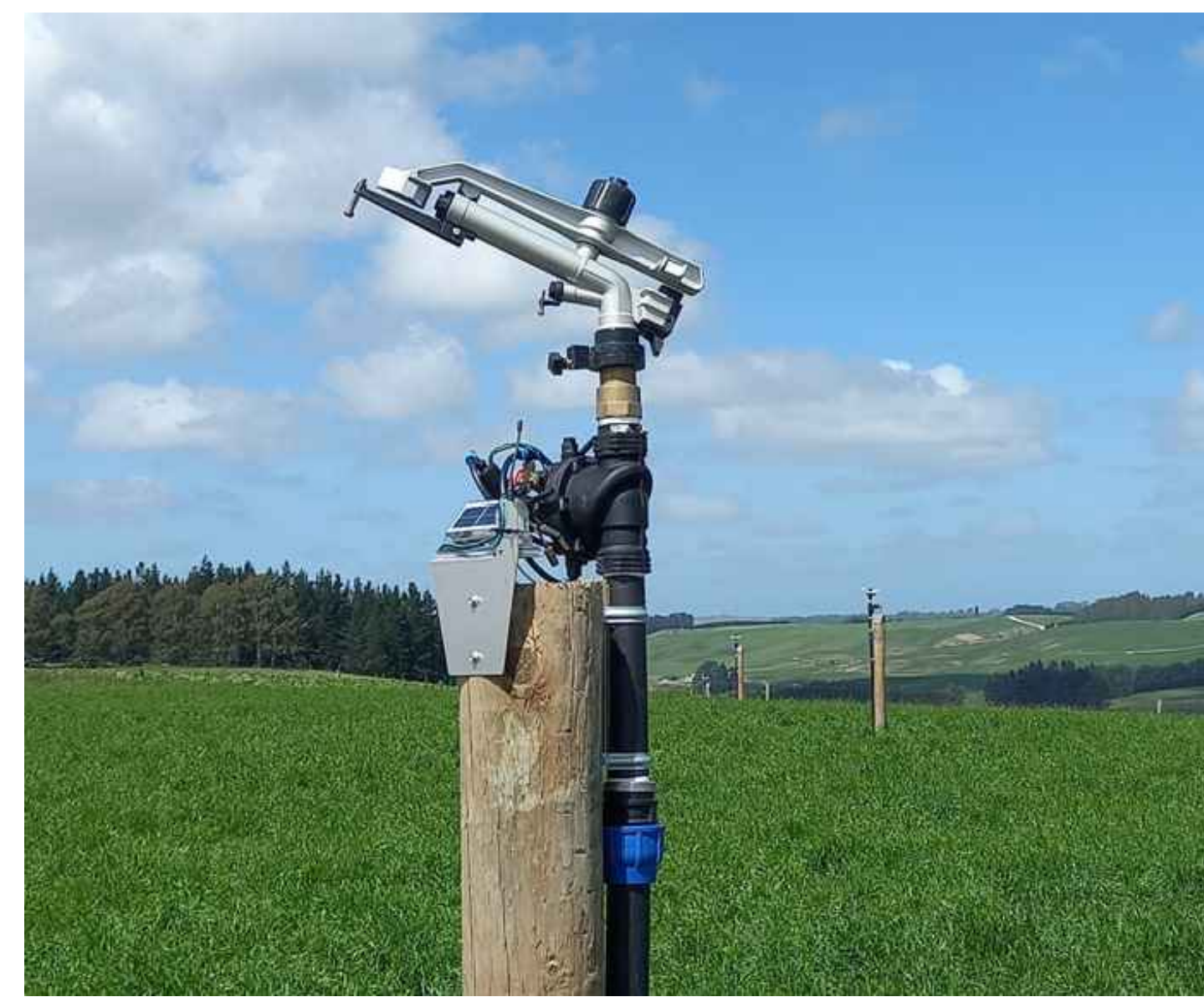
DETAIL A - TYPICAL OVERHEAD SPRAY IRRIGATION ARRANGEMENT